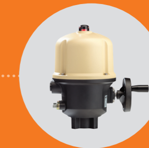
AQ5 - AQ10 - AQ15 - AQ25 - AQ30 - AQ50 SWITCH version