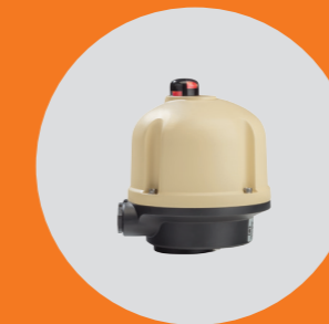
AQ1L - AQ3L - AQ7L