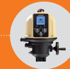
AQ5 - AQ10 - AQ15 - AQ25 - AQ30 - AQ50 LOGIC version