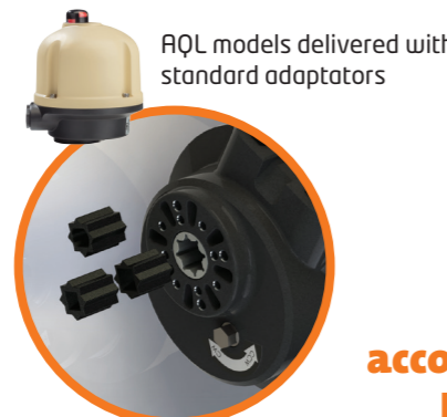
RQL models delivered with standard adaptors